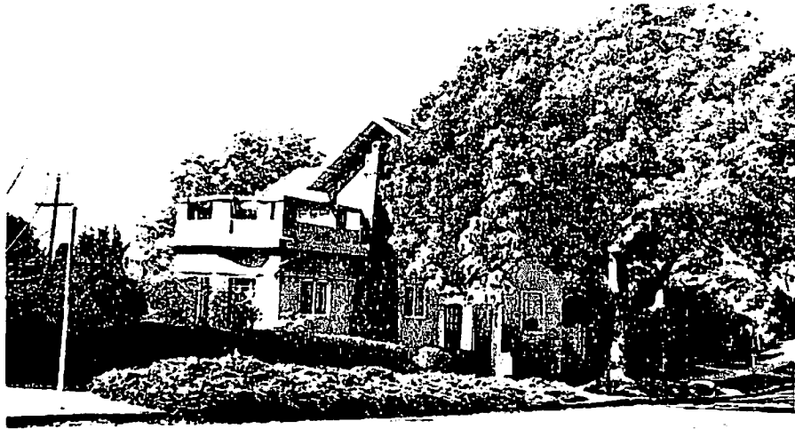
Faded, illegible text caption located below the first photograph.